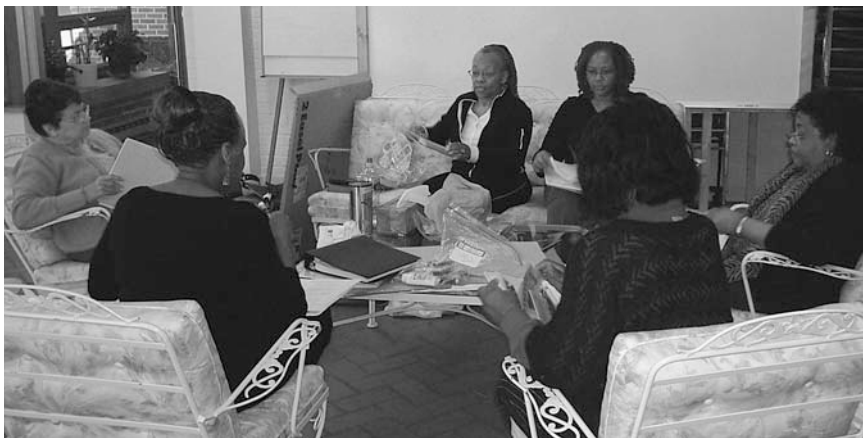
2006-2007 S.E.T. Ministry Family Empowerment Staff Retreat. S.E.T. Ministry believes strongly in encouraging staff to take time to grow and encourage one another to become a better team.